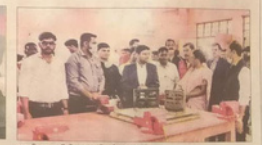
उद्घाटन का उद्घाटन करती नई नौकरी

मेगा स्किल में नौ ट्रेडों का दिना ज्ञान प्रसारण राज्य के अलग-अलग भागों में ग्रामीण क्षेत्रों में युवाओं को तकनीकी शिक्षा देने के लिए 'मेगा स्किल' कार्यक्रम शुरू किया गया है। इस कार्यक्रम के अंतर्गत ग्रामीण क्षेत्रों में तकनीकी शिक्षा के लिए 14 केंद्रों का निर्माण किया गया है।